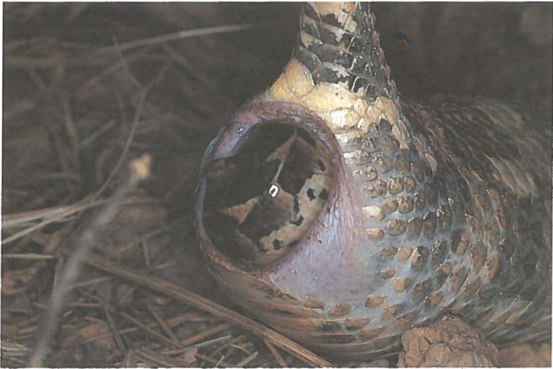
Foto 2. Bitis arietans , geboorte van een jong / birth of a young.