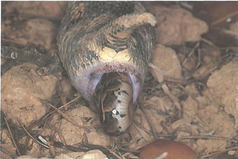
Foto 3. Bitis arietans , geboorte van een jong / birth of a young.