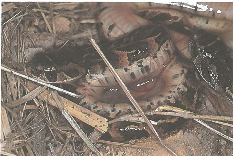
Foto 4. Bitis arietans , pasgeboren jong / newborn young.