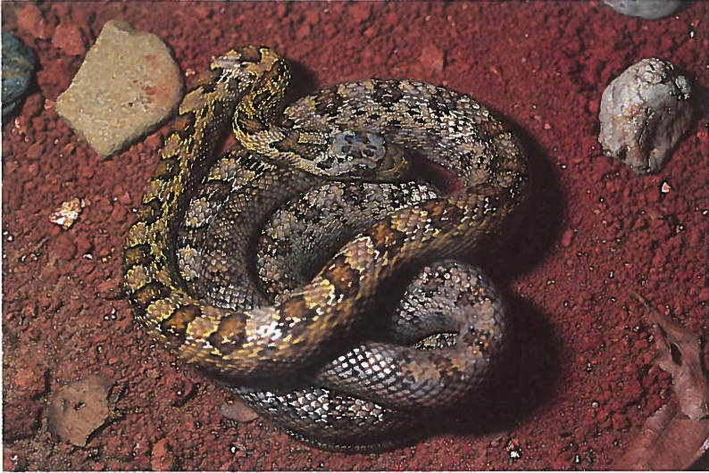
Foto 4: Elaphe bairdi , 1 jaar oud, 1 year old, Texas, USA; foto K.-D. Schultz.