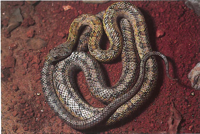
Foto 5: Elaphe bairdi , 1 jaar oud, 1 year old, N. Mexico; foto K.-D. Schultz.