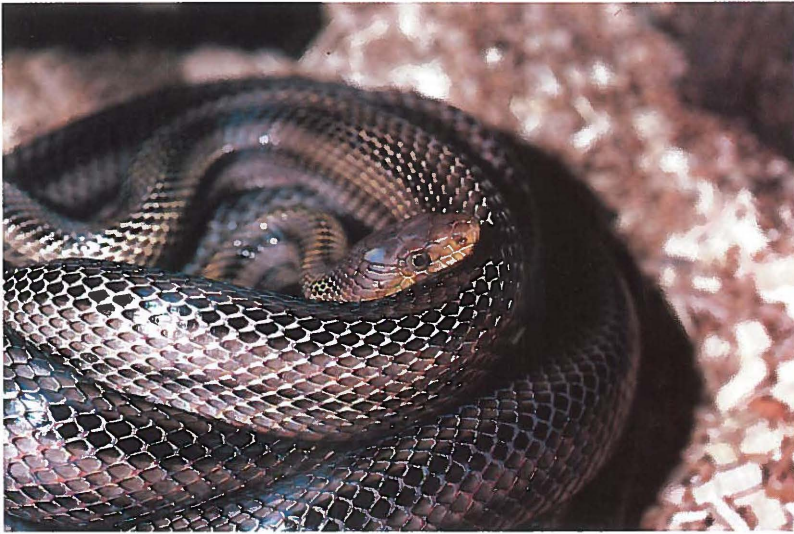
Foto 1: Elaphe bairdi , volwassen/adult, Texas, USA; foto K.-D. Schultz.