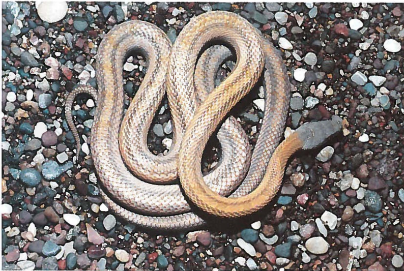
Foto 2: Elaphe bairdi , volwassen/adult, N. Mexico; foto L. Keller.